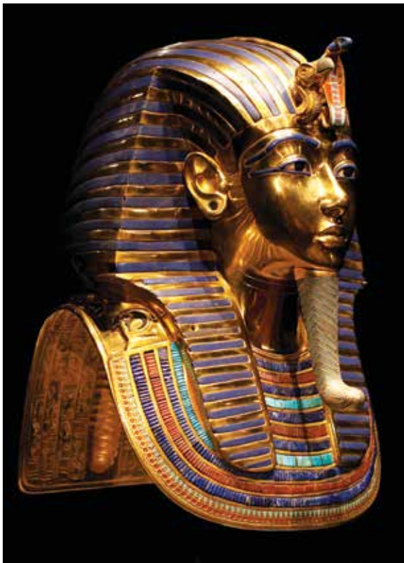
Gold mask of Tutankhamun. He is wearing the royal nemes headdress and ceremonial false beard.

One of the most striking features of ancient Egyptian culture was the pervasive belief in life after death. It is to this belief that we owe the pyramids. Many of the artifacts that stock the Egyptian section of modern museums were discovered in tombs, where they had been buried as provisions for the deceased in the afterlife.