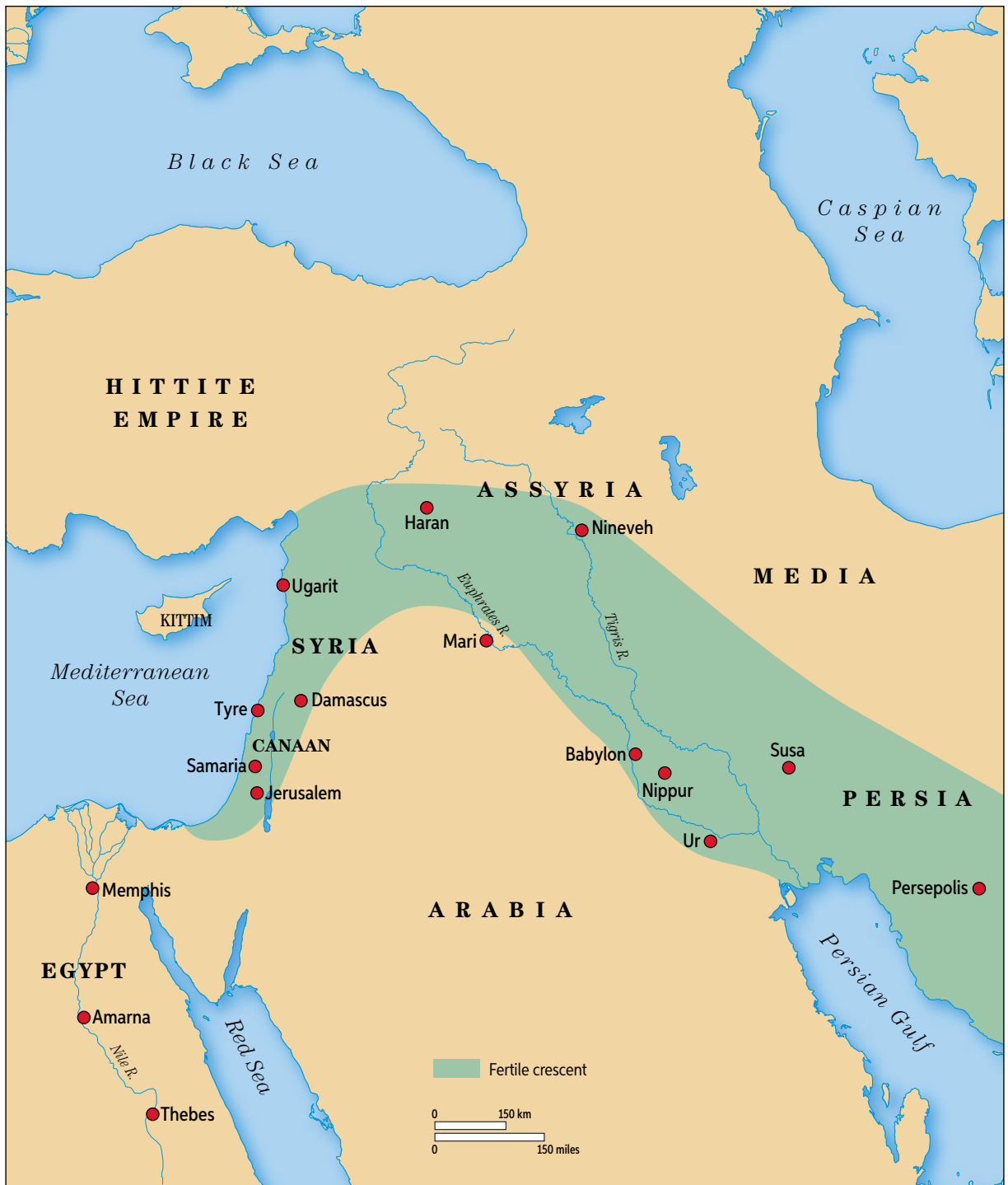
The Fertile Crescent