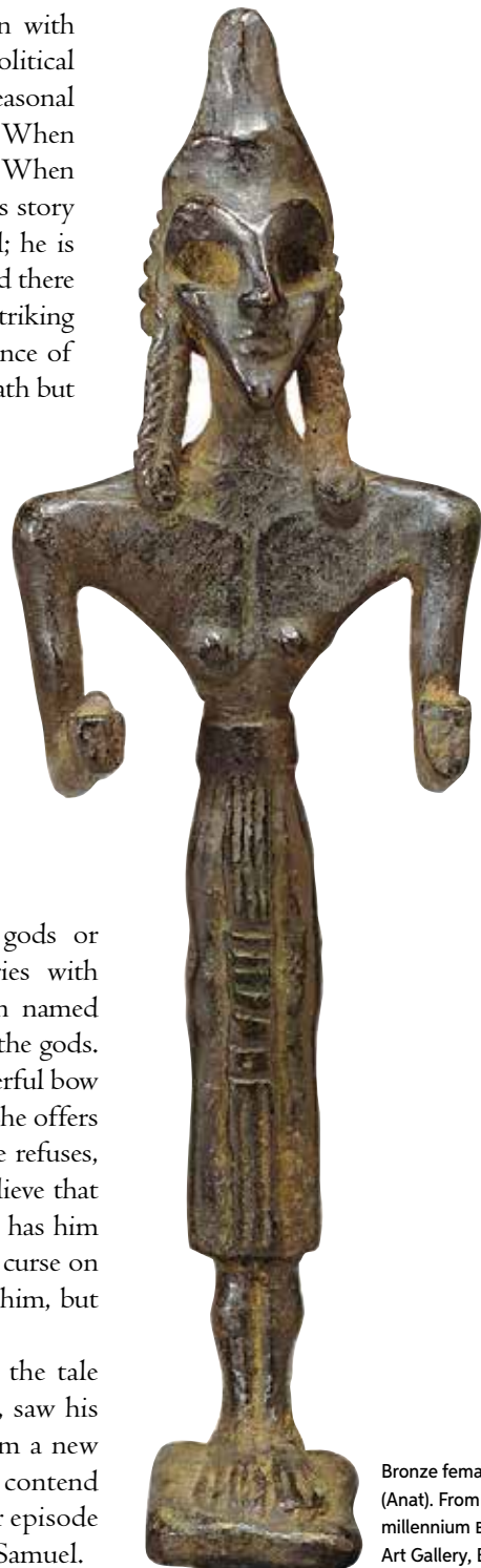
Bronze female figurine (Anat). From Syria, second millennium B.C.E. Walters Art Gallery, Baltimore.

Another cycle of stories from Ugarit tells the tale of a king named Keret or Kirta, who, like Job, saw his numerous family destroyed. The gods grant him a new family, but he is afflicted by illness and has to contend with a challenge to his rule by his son. The latter episode recalls the revolt of David's son Absalom in 2 Samuel.