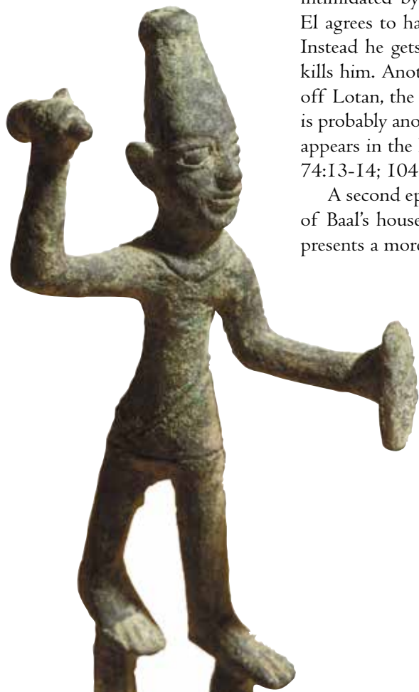
Bronze figurine of Baal, the Canaanite warrior god.