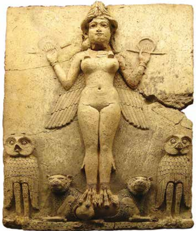
Babylonian relief, nineteenth or eighteenth century B.C.E., of a winged and eagle-footed goddess, possibly Ishtar. Known as the “Queen of the Night”, this relief is now in the British Museum, London.

The role of Ishtar draws attention to an aspect of Near Eastern religion that contrasts with the Hebrew Bible. Goddesses figure in the stories beside the gods. In general, goddesses declined in importance in the second millennium. One goddess who did not decline was Ishtar, who was associated with fertility in all its aspects. She is the goddess of thunderstorms and rain; she is also the goddess of battle. Above all, she was the goddess of sexual attraction. She was also associated with the morning star. She is most probably the goddess venerated as the “queen of heaven” (Jer 44:17, 19).