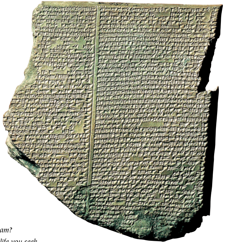
Tablet XI of the Babylonian version of the Epic of Gilgamesh. This tablet contains the flood account.

(Old Babylonian Version; Dalley, Myths , 150).