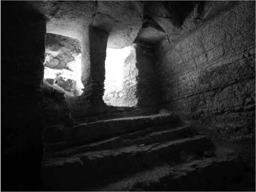
Fig. 02. A large mikveh near the Temple.

life, when he sought to persuade Gaius Caligula (Emperor from 37–41 CE) to rescind an order in the winter of 39 and 40 to send an army to Jerusalem to erect his effigy in the Temple so he might be declared a god. 21 The resulting calamities were averted by the assassination of the mad emperor on 24 January 41 CE, 22 and the Temple continued its supreme importance. The worldwide solidarity among most Jews was summarized by E. P. Sanders, who signaled the “payment of the temple tax by Diaspora Jews, pilgrimage to the temple from abroad, world-wide alarm at the threat of Gaius to have his statue erected in the temple . . . and many other points.” 23