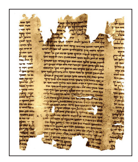
Fig. Int.3 A fragment of an Isaiah scroll from Qumran (1QIsab).

What this discussion shows is that it makes little sense to speak of verbal inerrancy or the like in connection with the biblical text. In many cases we cannot be sure what the