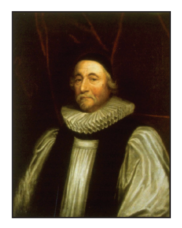
Fig. Int.4 Bishop James Ussher, who dated creation at 4004 B.C.E.

The destructions of Samaria and Jerusalem allow us to correlate the history of Israel with the general history of the Near East, since these events are also recorded in Assyrian and Babylonian records. The fall of Samaria is dated to 722 B.C.E. The Babylonians first captured Jerusalem in 597, and the destruction of the temple took place in a second conquest in 586. (A number of other events from the period of the monarchy can also be correlated with Assyrian and Babylonian records.) The chronology of the Second Temple period is relatively secure. The restoration of the Jewish community after the exile is dated to 539. The Maccabean revolt took place between 168 and 164 B.C.E. The Roman general Pompey entered Jerusalem in 63 B.C.E. The first Jewish revolt against Rome broke out in 66 c.E., and