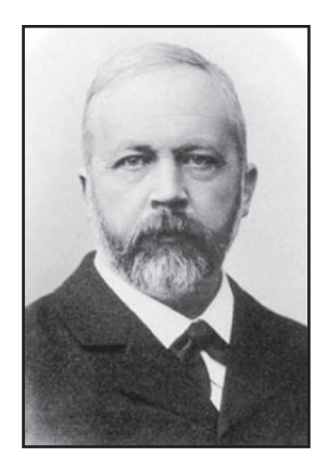
Fig. Int.5 Julius Wellhausen.

The history of biblical scholarship is in large part a sequence of attempts to come to grips with the composite character of the biblical text. In the nineteenth century, "literary criticism" of the Bible was understood primarily as the separation of sources (source criticism), especially in the case of the Pentateuch. (Source criticism was similarly in vogue in Homeric scholarship in the same period.) This phase of biblical scholarship found its classic expression in the work of the German scholar Julius Wellhausen (1844–1918) in the 1870s and 1880s. We shall consider the legacy of Wellhausen, which is still enormously