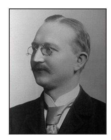
Fig. Int.6 Hermann Gunkel.

A reaction against this kind of sourcecriticism appeared in the work of another German scholar, Hermann Gunkel (1862-1932), in the last decade of the nineteenth century and the first two decades of the twentieth. Gunkel is regarded as the founder of form criticism. This method tries to focus on the smaller units that make up the biblical text, such as the individual stories of Genesis. Gunkel drew attention to the importance of literary form or genre. He recognized that the kind of truth that we may expect from a text varies with its genre. For example, we should not read poetry as if it were factual reporting. He also drew attention to the importance of social location (the Sitz im Leben) for the meaning of a text. It is important to know the purpose for which a text is composed, whether, for example, it was meant to serve as a cult legend in a sacred celebration or was meant for entertainment around a campfire.