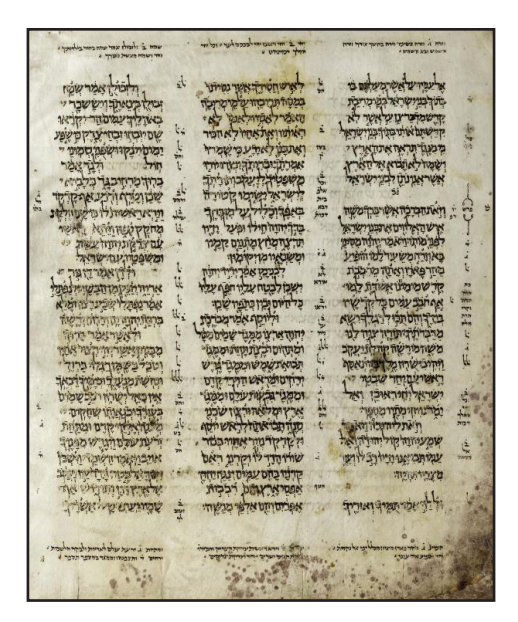
Fig. Int.2 A page from Deuteronomy in the Aleppo Codex.

The discovery of the Dead Sea Scrolls in caves near Qumran south of Jericho, beginning in 1947, brought to light manuscripts of biblical books more than a thousand years older than the Aleppo Codex. Every biblical book except Esther is attested in the Scrolls, but many of the manuscripts are very fragmentary. (A small fragment of Nehemiah only came to light in the 1990s). These manuscripts, of course, do not have the Masoretic pointing to indicate the vowels; that system was only developed centuries later. But they throw very important light on the history of the consonantal text.