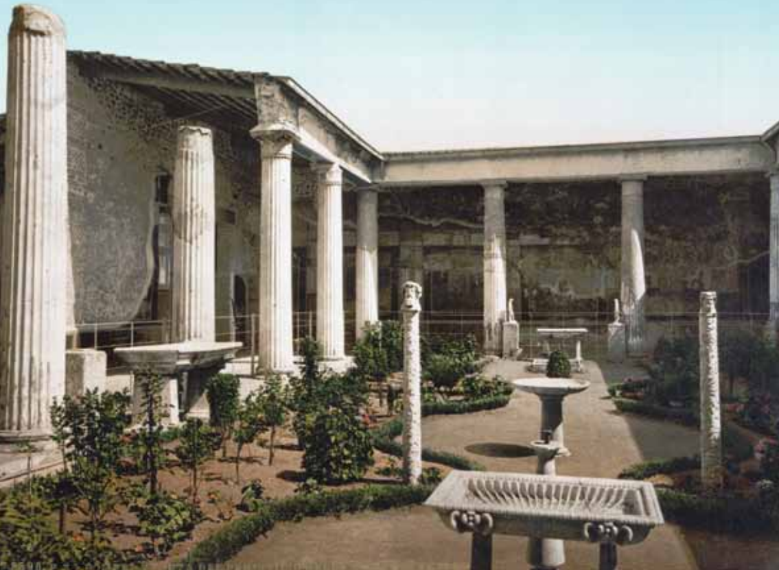
Image 14: The House of the Vettii in Pompeii, near modern Naples, was excavated and restored at the turn of the twentieth century. As always, the wealthy lived well, much better than the vast majority.

tend to think of a church primarily as a building. But there were no such buildings available for the earliest Christians. Upon reaching a new city, Paul may have preached initially in synagogues, as Acts portrays him, and perhaps he occasionally even hired a public hall (see Acts 19:9); but the principal meeting place of Christian cells or churches was the private home. Thus the householder, who could provide such a place of meeting, was a most important convert for the Christian community. (See also Chapter 12.6, Behind the New Testament: House Churches.)