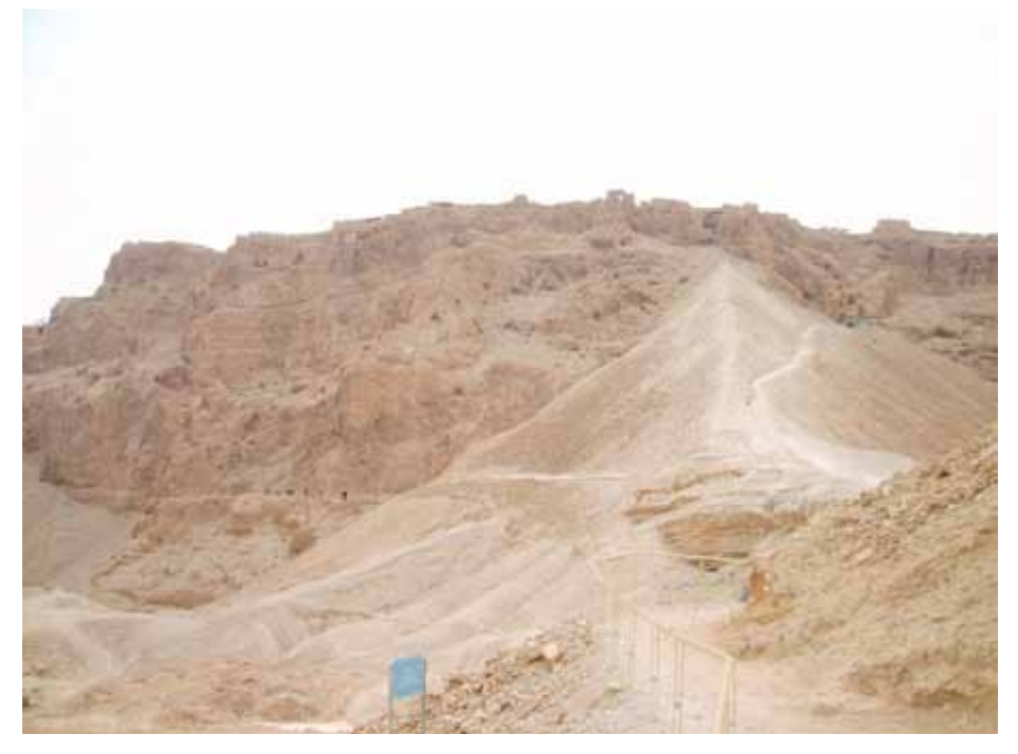
Image 9: Masada, the Jewish fortress. The road from the bottom left to the top right is the ramp the Romans built for their assault is barely visible.

The character of Judaism during the time of Jesus and the early church was much affected by conditions in the Jewish homeland. Because the Jews believed that their land had been given them by the same God who had called them to be his chosen people, those who lived in Palestine chafed under foreign domination. Even though Jews generally looked for relief from foreign oppression and the restoration of the Davidic monarchy, many were content to wait upon God for the fulfillment of this hope. Some Jews thought it was near at hand. Others had made their peace with Hellenistic culture and Roman rule and probably did not really yearn for their overthrow. There were also large numbers of Jews living outside Palestine for whom political independence was not a burning issue. Indeed, rebellion in the homeland presented the grim and unwelcome possibility of retaliation against Jews elsewhere.