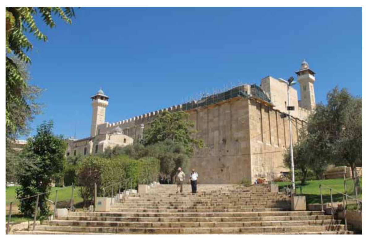
Image 8: These massive walls around the tombs of the patriarchs of Israel (see Gen. 23:9) in Hebron, a few miles south of Bethlehem, were originally constructed by Herod the Great (Matt. 2:1-23), who also rebuilt the temple of Jerusalem (John 2:20).

After the death of Herod, the kingdom was split into three parts, apportioned among three surviving sons. (See this book's frontispiece: "Palestine at the time of the New Testament.") Philip became tetrarch of the region northeast of the Sea of Galilee, including Iturea and Trachonitis, and reigned over that largely Gentile area from 4 B.C. until A.D. 34. Herod Antipas became ruler of Galilee and Perea (4 B.C.-A.D. 39). Archelaus became ruler of Samaria, Judea, and Idumea, but was deposed after a short reign. Following his deposition in A.D. 6, a Roman procurator, or prefect, was installed as ruler of Judea. The procuratorship remained in continuous effect until the brief reign of Agrippa (37-44) and was resumed thereafter. Pontius Pilate (26-36) was the fifth of these procurators,