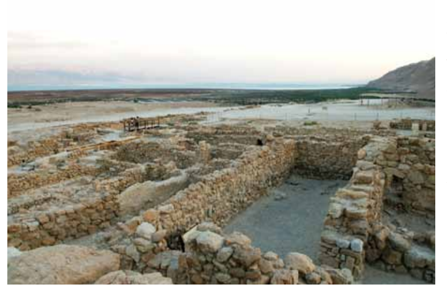
Image 11: The Scriptorium at Qumran, where the Dead Sea Scrolls were discovered. Though no scrolls have been discovered in the ruins of this site itself, archaeologists conjecture that this room may have been used for copying documents.

In addition, they looked toward the future vindication of Israel, or at least of their own community as Israel's true remnant. This vindication was expected in the form of an apocalyp-tic drama, a conflict in which the forces of light