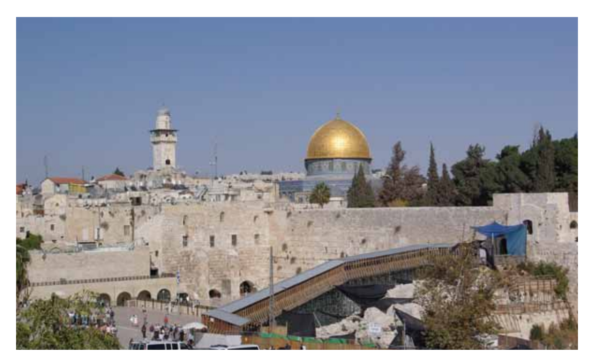
Image 10: Jerusalem, facing the Western Wall, or Wailing Wall, of the temple area. In the center is the Dome of the Rock, erected in the late seventh century as an Islamic shrine. Probably it stands on the site of the Second Temple of Judaism, which Herod the Great extensively renovated (see John 2:20).

quietists who generally cooperated with the Romans. As members of the establishment it was in their interest to do so. They would have nothing to do with the relatively late doctrine of the resurrection of the dead, but adhered instead to the older and more typically biblical (Old Testament) view that death is simply the end of significant conscious life. In this they differed from the Pharisees, as well as from Jesus and the early Christians.