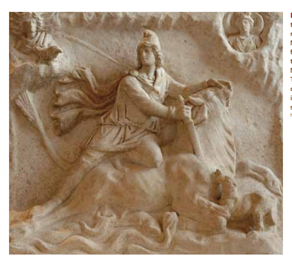
Image 16: Among the Roman mystery religions, the cult of Mithras was known for its frequent use of the image of the god Mithras slaying a bull. This Roman relief, now displayed in the Louvre, is one depiction of this scene.

promise of eternal life. Membership in them presumed a belief in their efficacy and required a conscious act of the will, a decision. Thus the mystery religions had a character decidedly different from that of traditional official religions and were in some respects not unlike Christianity. That is, they were private, they were oriented around hope and assurance for the future, and they were voluntary. To some outsiders, early Christianity may have seemed to be a mystery cult. Unlike Judaism and Christianity, however, the mysteries did not claim the exclusive loyalty of their adherents. A person might worship Zeus and the emperor and at the same time be an initiate of one or more mysteries. In fact, the official religions and the mysteries were complementary; they applied to different spheres of life, the one to public order and morality, the