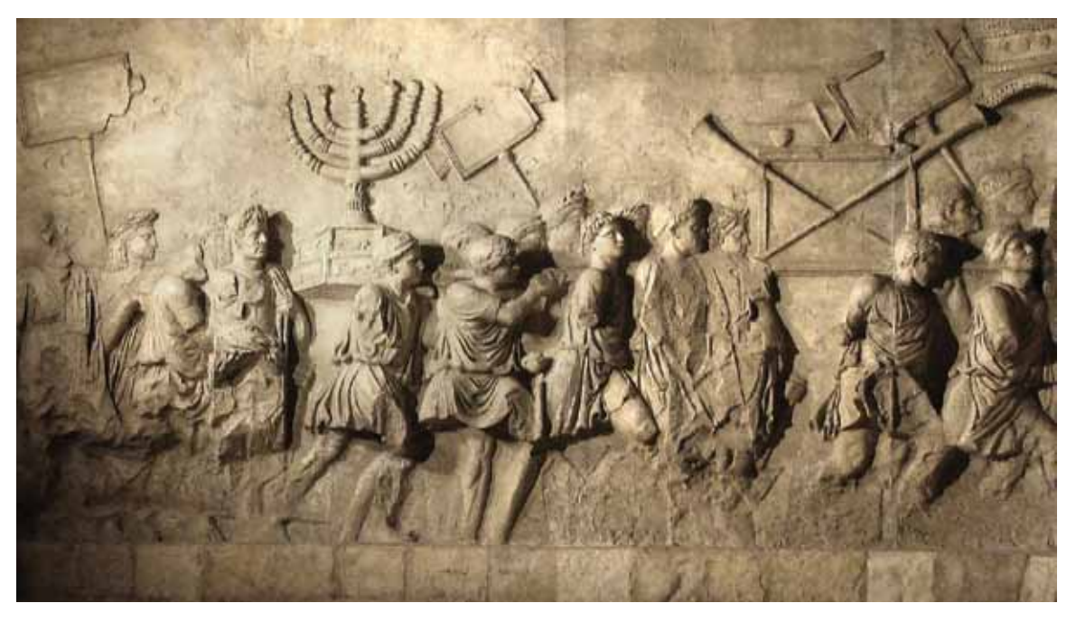
Image 6: This scene from the Arch of Titus in the Roman Forum celebrates the Emperor Titus's capture of Jerusalem in A.D. 70. The victorious Romans triumphantly bear the sacred objects of the Jerusalem temple, including the menorah, or seven-branched lampstand, symbolizing the presence of God.

One cannot understand the New Testament without a working knowledge of the culture from which it arose. Students who ignore this chapter do so at their peril.