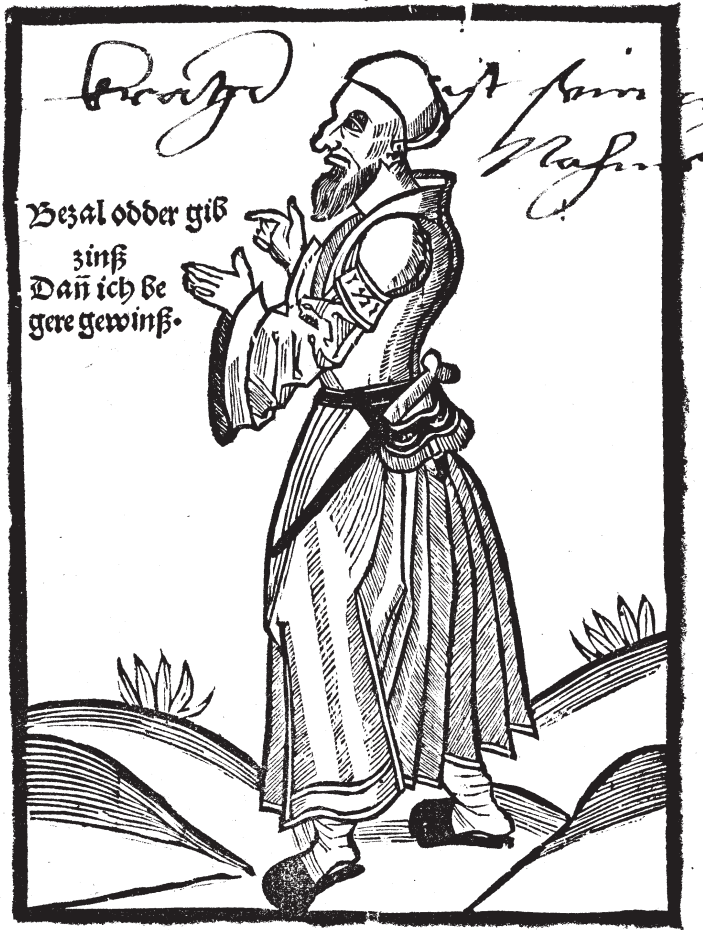
Woodcut of a Jewish money-lender from the title page of Luther's sermon on usury, Eyn Sermon von dem Wücher , 1520.

In February of 1537, while on a trip to Smalcald, Luther was ill with a terrible bout of kidney stones, in fact so ill that he thought he was dying. Among the several statements that were recorded at his bedside, one reveals something vital about Luther's own self-understanding: "I'll be and I'll die an enemy of all the enemies of my Christ." 31 As the 1543 statement above shows, not only the rabbis but also those Christian interpreters who follow them in matters theological are high on the list of those regarded by Luther as "the enemies of my Christ."