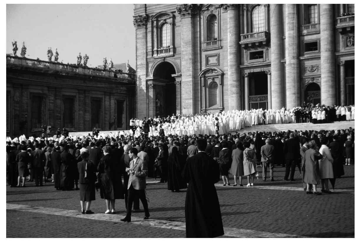
Fig. 1.1. The start of the Second Vatican Council, 1962.

The Second Vatican Council, convoked by Pope John XXIII (1958–1963) and concluded by Pope Paul VI (1963–1978), provided the foundations for a philosophical social ethics based on the concept of "liberation of the oppressed"—that is, the struggle for the material and educational conditions that would allow for vast sectors of the world population to overcome economic misery.