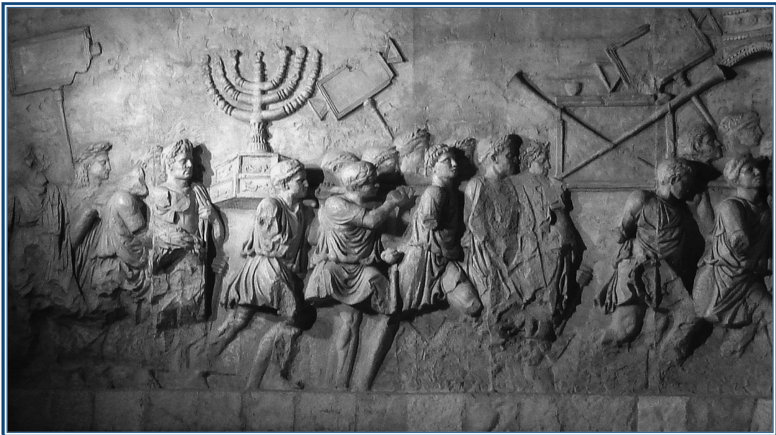
FIGURE I.4. The Arch of Titus. The treasures from the destruction of the Jewish Temple (70 c.E.) are displayed in this triumphal procession on the Arch of Titus in Rome.

c.E., just before leaving Caesarea to go to Rome, Paul had an audience with Agrippa II, King of the Jews, and his sister Berenice at which Agrippa is reputed to have interrupted Paul's discourse to concede that he would soon make a Christian of him if he kept up his preaching. En route to Rome, where his case had been transferred, Paul was shipwrecked on Malta. Upon arriving in Rome, he was under house arrest but seems to have continued preaching until at least 64 c.E. Although Christian tradition provides several vivid accounts of Paul's death by martyrdom in Rome, perhaps under Nero, one of our most ancient documents (apart from the New Testament) is more vague. In the First Epistle to the Corinthians , the apostolic father Clement of Rome reports