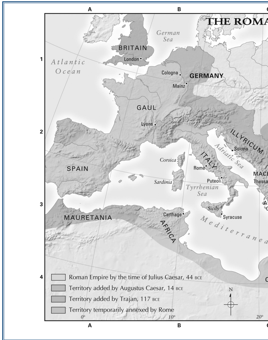
FIGURE 1.6. The Roman Empire