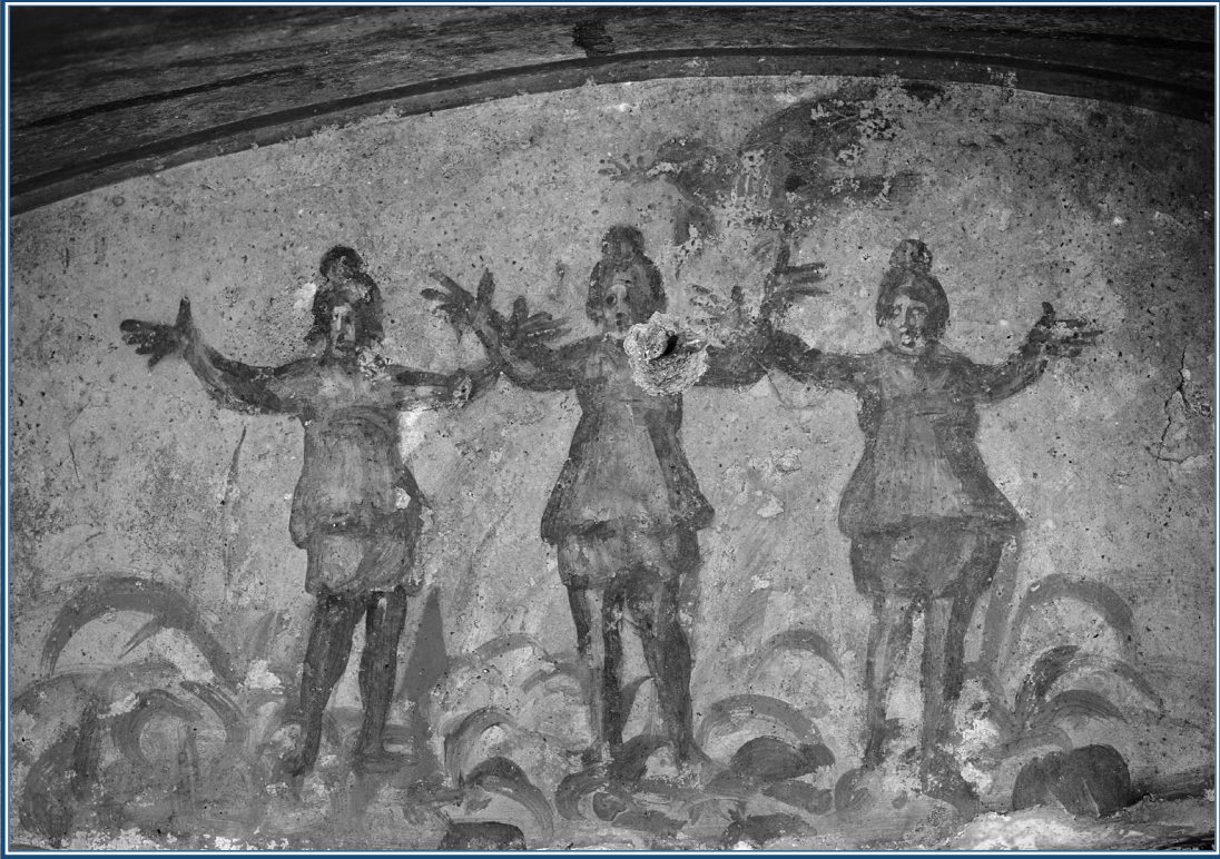
FIGURE I.5. Story of the fiery furnace. The story of the redemption of three young men in the “fiery furnace” from the Old Testament (Daniel 3) is depicted in an early Christian setting. This late third-century painting is in the Catacombs of Priscilla in Rome.

the great fire of 64 C.E. in Rome, in order to deflect the charge that he had started it himself so that he could build his famed Domus Aurea (“Golden House”). Tacitus’s account of the fire reveals the reason that Christians were despised enough to become Nero’s scapegoats: they were misanthropes who rejected civic intercourse. For this, Tacitus tells us, the Christians were covered with the skins of beasts and torn apart by dogs, or they were nailed to crosses and set on fire, then used as human torches to light the night. Suetonius also wrote of the antipathy Nero held for Christianity.