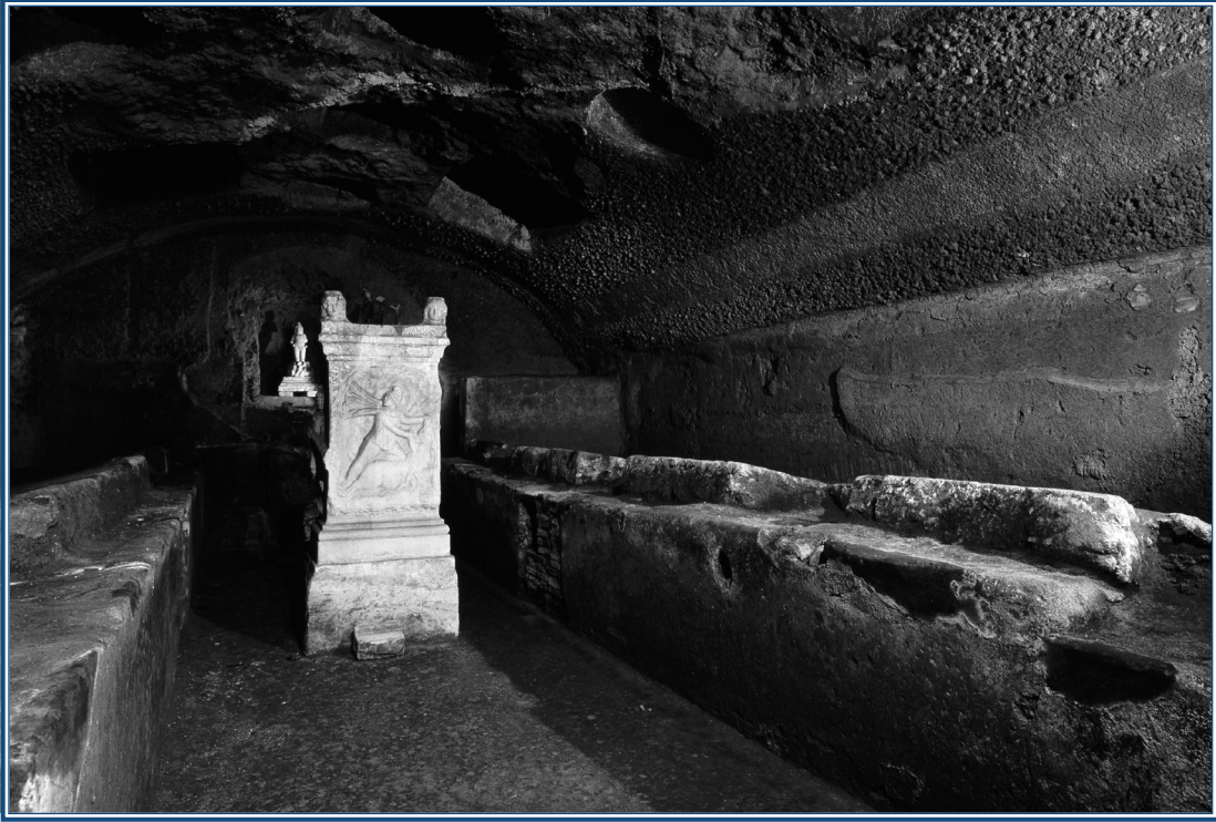
FIGURE 1.2. The Mithraeum of San Clemente. Dedicated to the worship of Mithras, this second-century altar is located in a sanctuary beneath the fourth-century Basilica of San Clemente in Rome.

we learn that strains of Gnostic belief predated Christianity and that there were many and various sects within the movement that drew upon the teachings of Plato, Judaism, and, later, Christianity. Like the mystery religions, Gnosticism, from the Greek gnosis , “knowledge,” held that there were two worlds, that of matter and that of spirit. In the second century, one form of Gnostic Christianity promised an escape through knowledge from the world of matter into the world of spirit where gnosis was reserved for an elect few. Theirs was a complex cosmogony of emanations (called aeons) from a creator god who was derived