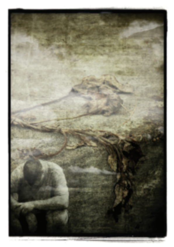
Fig. 38.6. "So I hated life, because what is done under the sun was grievous to me; for all its vanity and a chasing after wind" (Ecclesiastes 1:14).

most conservative scholars take these references seriously. Elsewhere in the book the author speaks as a subject of the king (8:2-5; 10:4-7, 16-17, 20) who is aware of the abuses perpetrated by the wealthy and powerful but is unable to do anything to stop them (4:1; 5:8; 8:9). In addition, the Hebrew style of the book is clearly postexilic, which rules out authorship by Solomon or any other king. The depiction of the author as a king of Israel in the opening chapters of the book appears to be a literary device designed to allow the author to explore the extreme case of his thesis, just as we witnessed in the book of Job.