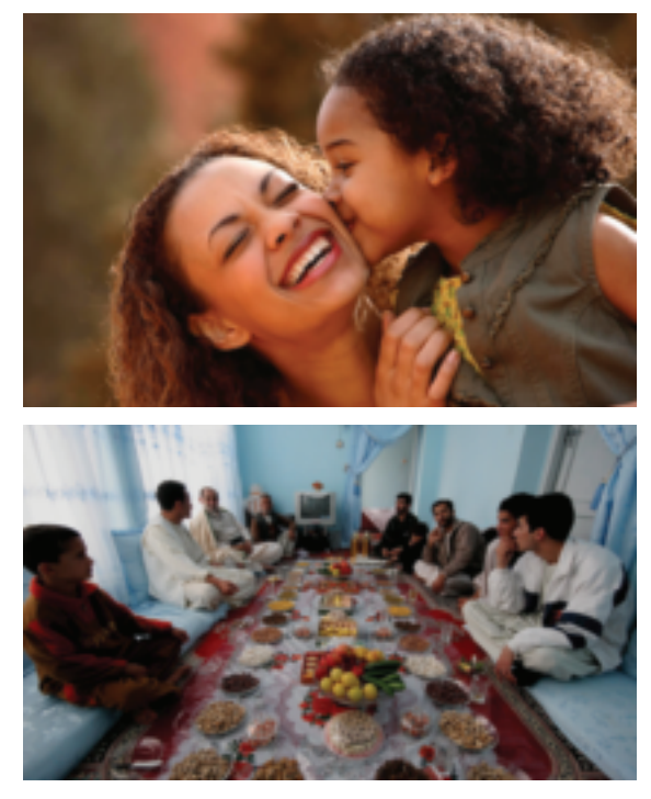
Fig. 38.8. The book of Ecclesiastes encourages its readers to find pleasure in the simple things of life, such as family and good food.

1. Enjoy the simple pleasures of life. People who attempt to make sense of life and understand the order of the universe are simply wasting their time and energy. That path leads only to frustration and trouble. The same is true for those who work hard to get ahead in life; they can never be satisfied with what they have. Instead of striving to gain things that are beyond their ability to achieve, humans should take pleasure in the simple gifts that God supplies every day: productive labor, good food and drink, a wife and family, fresh clothes, friendships, and similar experiences (2:24-26; 3:12-13, 22; 4:9-12; 5:18-20; 8:15; 9:7-10; 11:9). Those whom God has blessed with wealth and possessions may enjoy these as well, as long as they keep in mind that all of these things are ultimately vanity