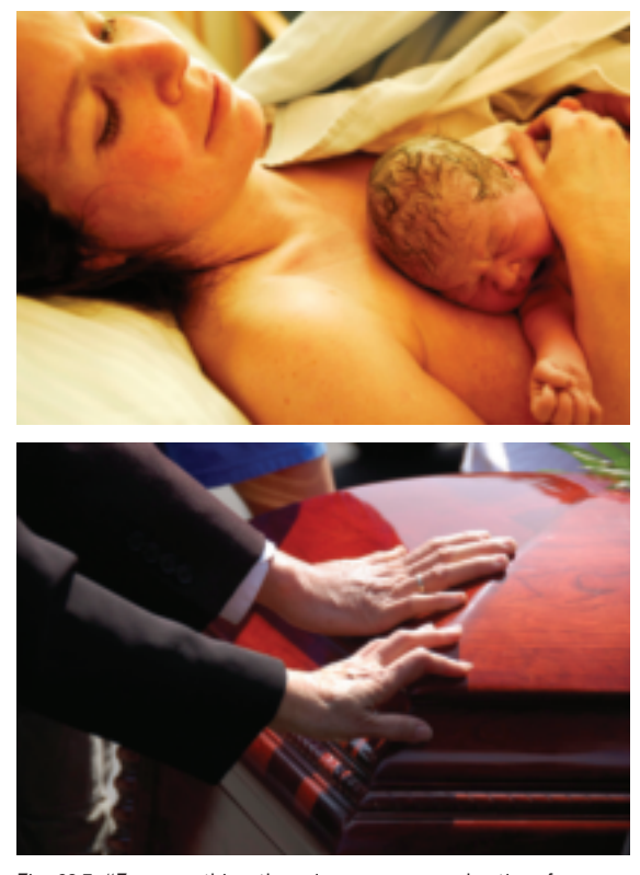
Fig. 38.7. "For everything there is a season, and a time for every matter under heaven: a time to be born, and a time to die" (Ecclesiastes 3:1-2).

This emphasis on the vanity of human activity lies at the heart of the message of Ecclesiastes. The term vanity is used to sum up the author's discovery that life seems to have no obvious goal or purpose. The book begins with a series of poetic reflections on the cyclical nature of the natural world, where everything that transpires is only a repetition of similar events from the past, producing no lasting change (1:2-11). From here the author turns to an examination of human experience, where he finds a similar pattern at work. No matter how hard people labor to improve their fortune in life, they cannot hold