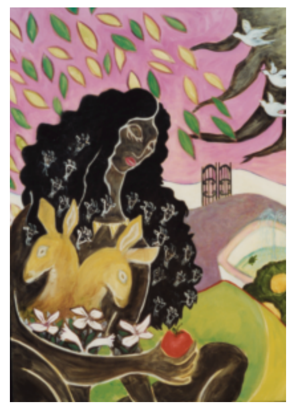
Fig. 38.9. "Your hair is like a flock of goats, moving down the slopes of Gilead....Your two breasts are like two fawns, twins of a gazelle, that feed among the lilies" (Song 4:1, 5).

narrative material that give the illusion of a loose story line. In actuality, most scholars view the text as a collection of love poems from different times and places that has little or no narrative unity.