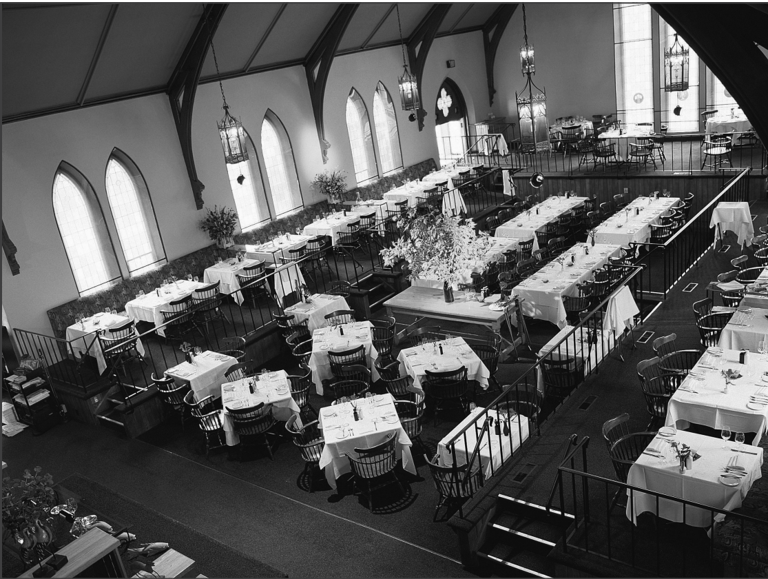
Some churches have been converted into restaurants and other entertainment venues.

To the degree that organized religion is discredited, the practice in Christian churches of weekly meetings for the worship of God and communal religious inspiration will suffer. If students adopt an attitude of spirituality rather than the practice of a religion, or if they are uninterested in Christianity, or if they are drawn toward other fascinating course options, students may judge that a course