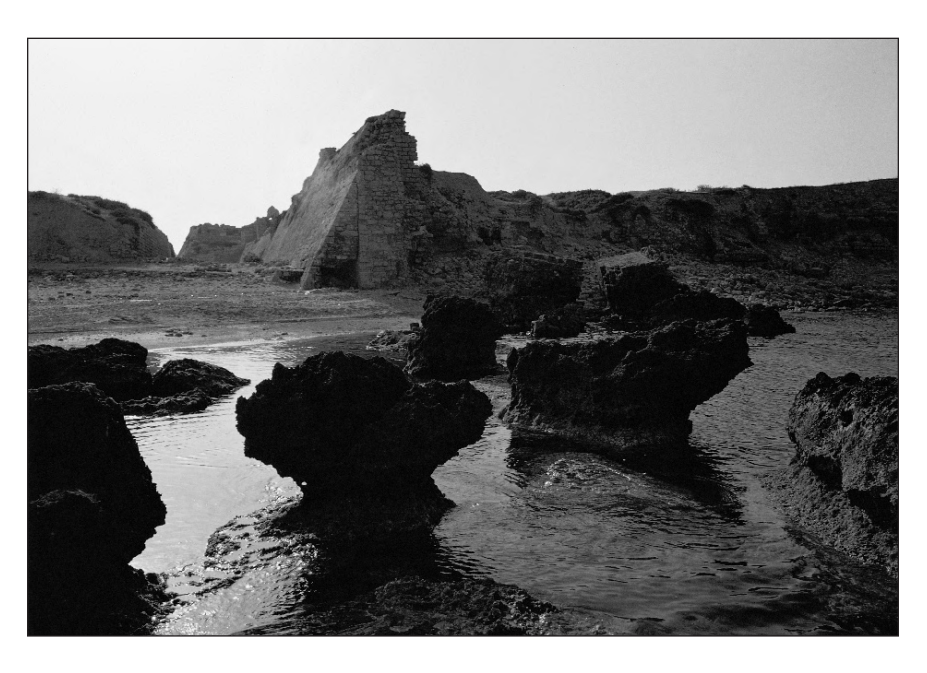
The ancient harbor of Caesarea, built by Herod the Great in 22–10 B.C.E., was the Roman administrative center of Judea. Paul was judged here.

Guilds in Greco-Roman cities were generally under the patronage of deities and local patrons. Israelites had guilds of purple dyers and carpet weavers (Hierapolis, Phrygia), goldsmiths (Corycus, Cilicia), and fishermen (Joppa, Palestine). They also worked as merchants and traders of spices, perfume, wine, linen, cloth, and silk. Others were bakers, boot makers, physicians, and bankers. Several of the nearly one hundred inscriptions (three in Hebrew, the rest in Greek) discovered in connection with the excavation of the Sardis synagogue reveal that eight synagogue members were also members of the municipal council, which routinely involved oaths and prayers to the local protective gods. Such provincial councilors ( decuriones ) were hereditary positions held by people of wealth. Other elite members of Sardis included Aurelius Basileides, a former procurator, and Paulus, a comes (i.e., a