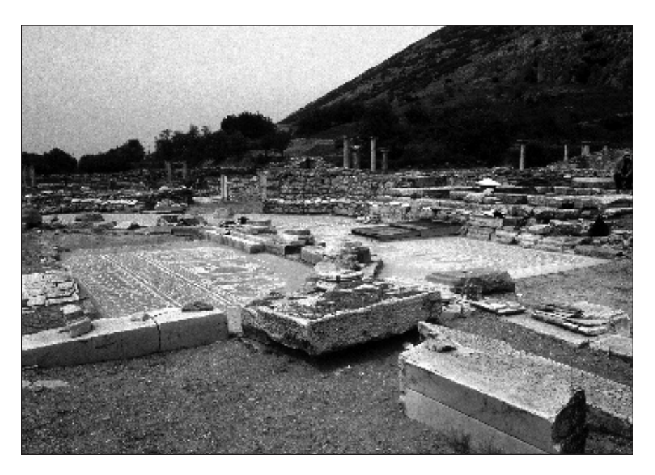
This Christian church of Philippi can be dated from approximately 313–350 C.E. on the basis of the floor's foundational mosaic inscription (see photo on page 19). It is the earliest known public gathering place for Christians in Greece and Macedonia that can be dated with some certainty.

The Israelite innovation communicated by Paul to Israelite groups located in non-Israelite majority cities of the Eastern Mediterranean was a piece of radically