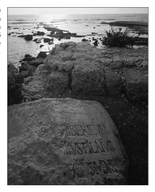
This stone inscription (Caesarea Maritima) honors Emperor Tiberius and Pontius Pilate, prefect of Judea (26–36 C.E.), where Paul reported he persecuted Jesus groups.

Are they Israelites? So am I. Are they descendants of Abraham? So am I" (2 Cor 11:22, with emphasis on genealogy and implicit geography). The geography in both instances is Judea (not Tarsus, as in Acts 9:30; 21:39; 22:3).